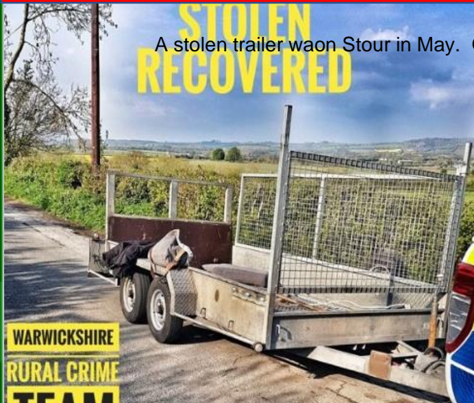
A stolen trailer was recovered from near Shipston Rural Crime Team officers from the recovered from near Shipston Rural Crime

Team made contact with the manufacturer of the trailer and were able to confirm that it had been stolen in February 2021 from a building company in Worcestershire. As well as informing the police of the theft the owners had