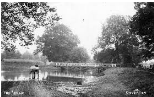
The River Arrow at Coughton