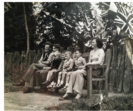
Coronation Day photo, who knows who's on here?